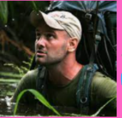
Ed Stafford overcame many dangers by being brave.