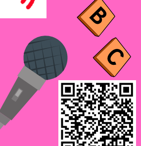
English room video Part 1.