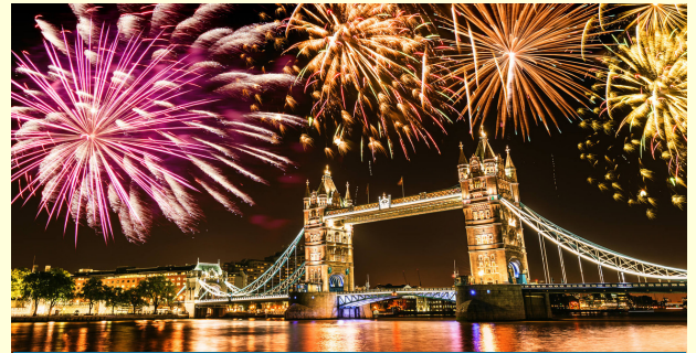
Fireworks over Tower Bridge, London