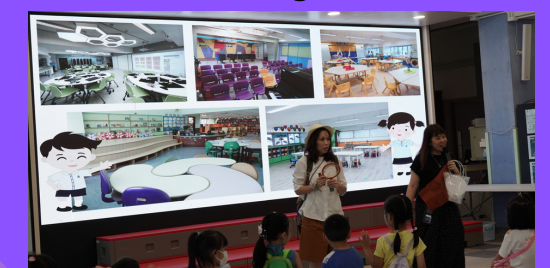
Children preparing to start their learning adventure at YLMPS.