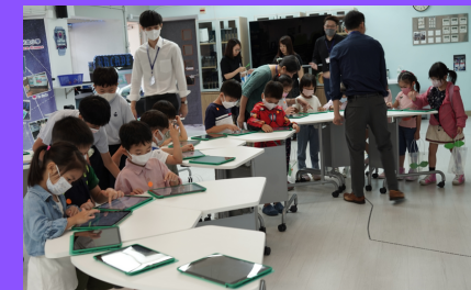
Students learning to code in the IT lab.