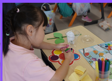
This girl is making memories as she makes her learning flower.