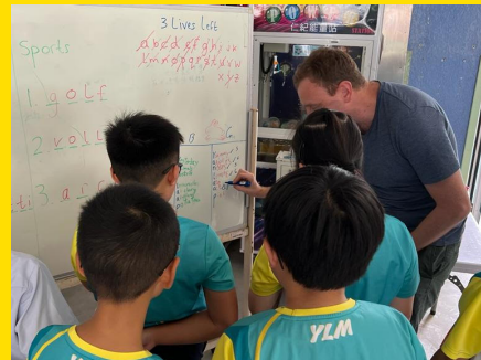
Some P4-6 students enjoying the recess games.