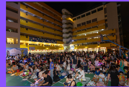
Our school looking amazing as it hosts all the party-goers.