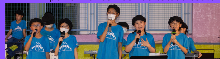
Talented students singing wonderful songs to make sure the party was loved by everyone!